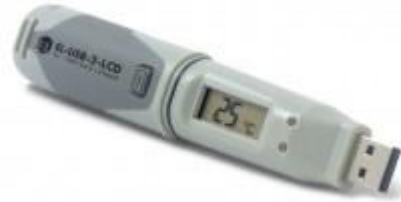
Figure 1. An example of a data logger for temperature and humidity measurement: Lascar EL-USB-2-LCD

Average temperature and humidity can be measured every hour (or half-hour, or 5 minutes, etc.) for a long time with this type of data logger: The battery can last many months for hourly measurements (according to the equipment specifications). Instant results are presented on a small LCD screen and a long series of recordings can be stored. When the data-logger is plugged into the USB port of a computer with EasyLog USB software installed, the detailed data is immediately available as time trend graphs and the data can be downloaded for analysis into any software (e.g. Excel). A guidance document on the use of this equipment for heat and health studies is available at the website of the journal Global Health Action (paper by Byass et al., 2010).